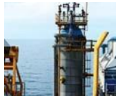
Offshore Drilling Rig