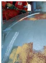
Rust Grip® penetrates deep into the pores of and seals the surface from further corrosion.

Corrosion prevention and protection for the past 50 years has yielded inefficiencies for industries that depend on critical infrastructure. With many of these methods, limited success is achieved because most corrosion coatings are "glue-on-to-surface." This process doesn't allow for corrosion to be controlled in the pores of applied surfaces and won't protect against mold and mildew among other environmental toxins