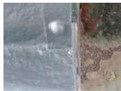
Rust Grip® requires minimal preparation

After one application, it can penetrate deep into and seal the surface, blocking corrosion quickly and effectively.