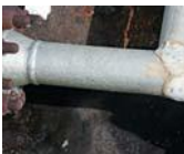
Corrosion Under Insulation