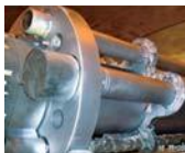
Drill Pipe Risers