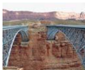
Hoover Dam Bridge

Business Development / Technical Support Email: Help@Spinfo.com .